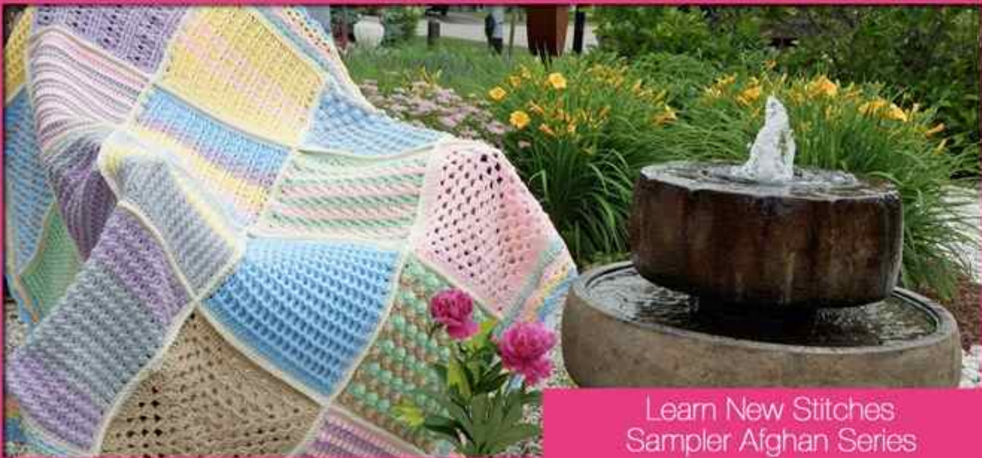
Learn New Stitches Sampler Afghan Series