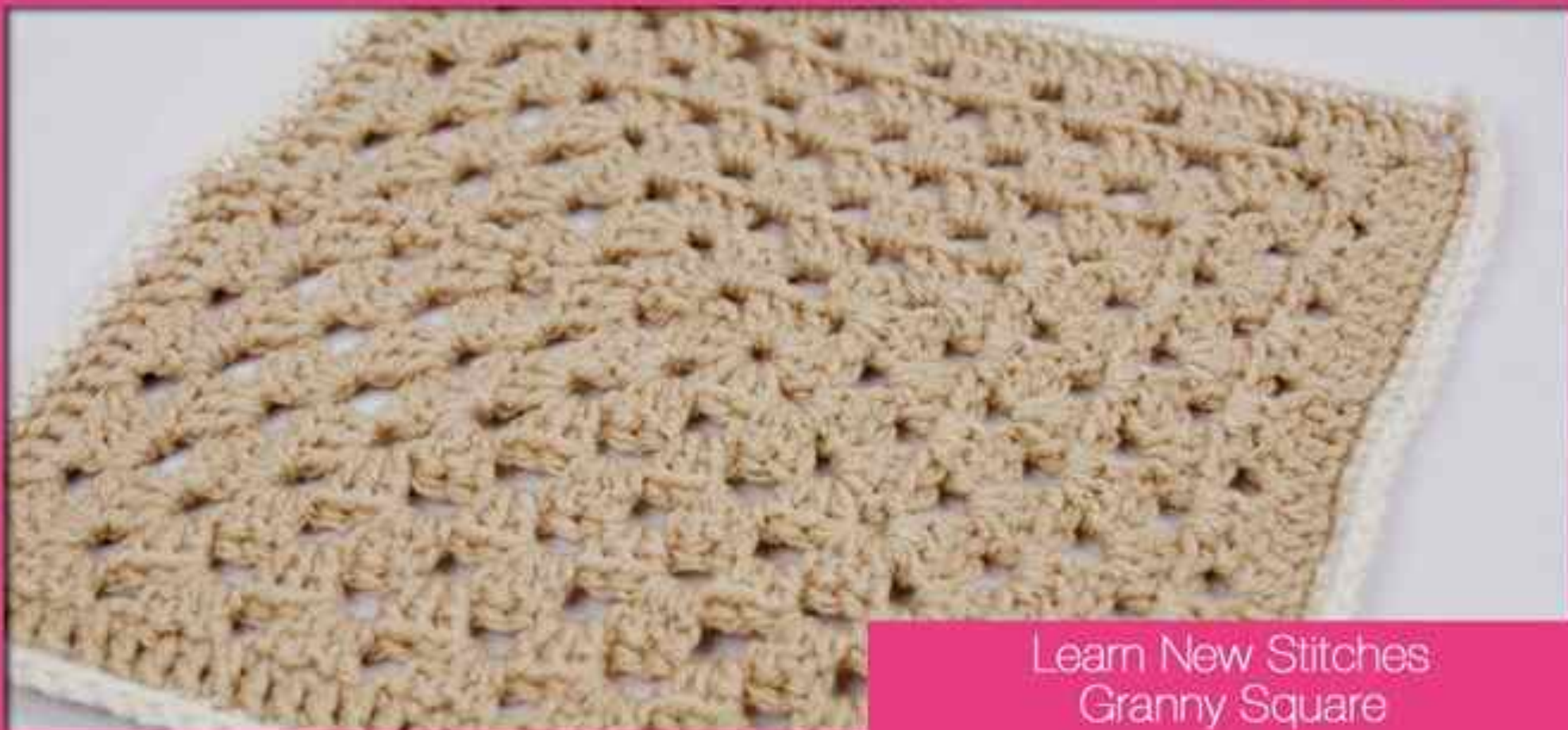
Learn New Stitches Granny Square