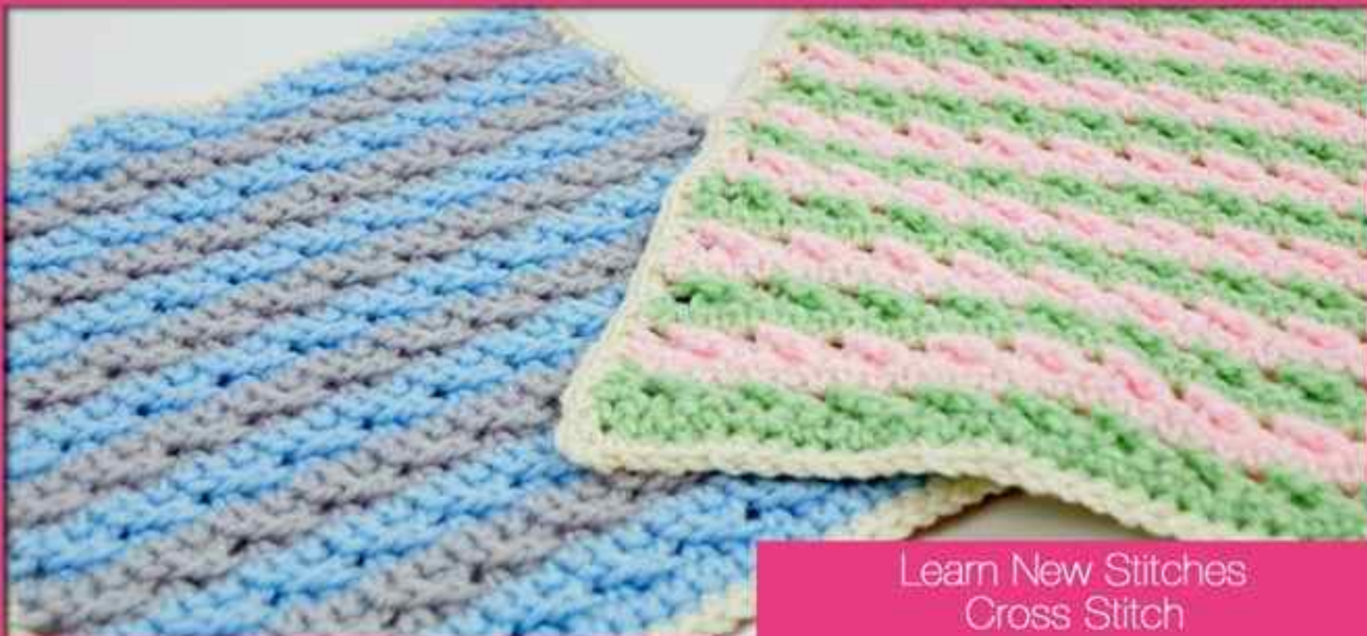
Learn New Stitches Cross Stitch