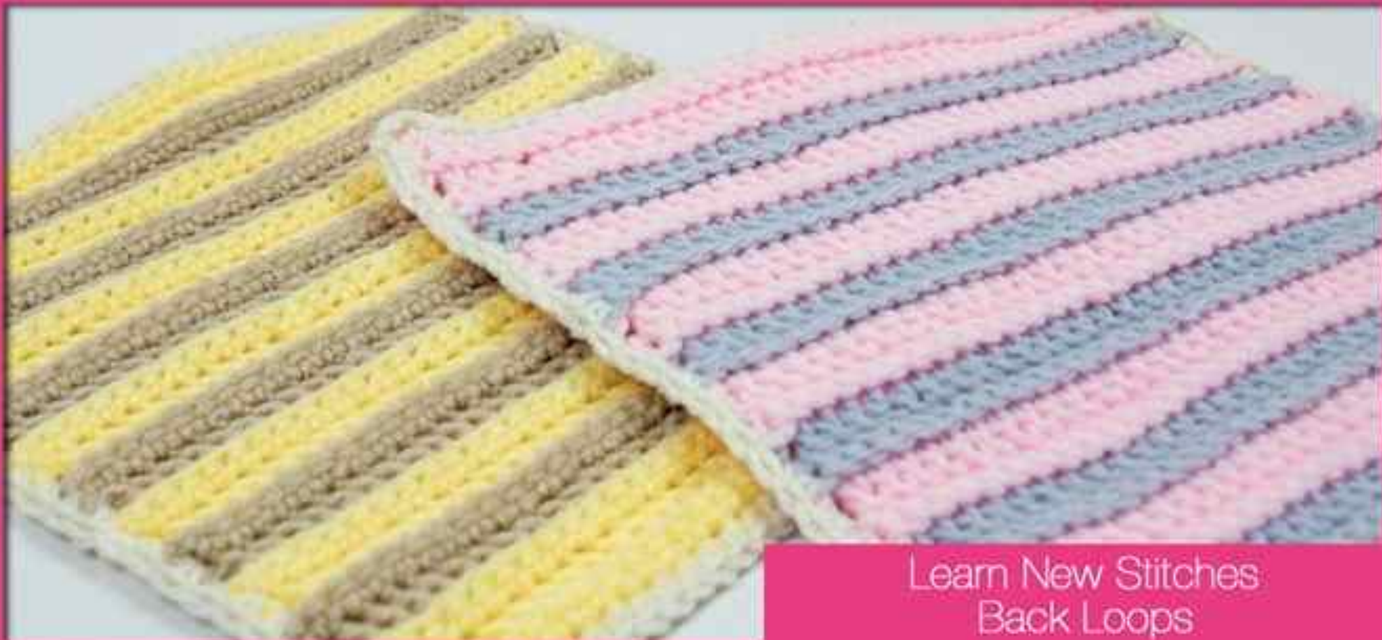
Learn New Stitches Back Loops