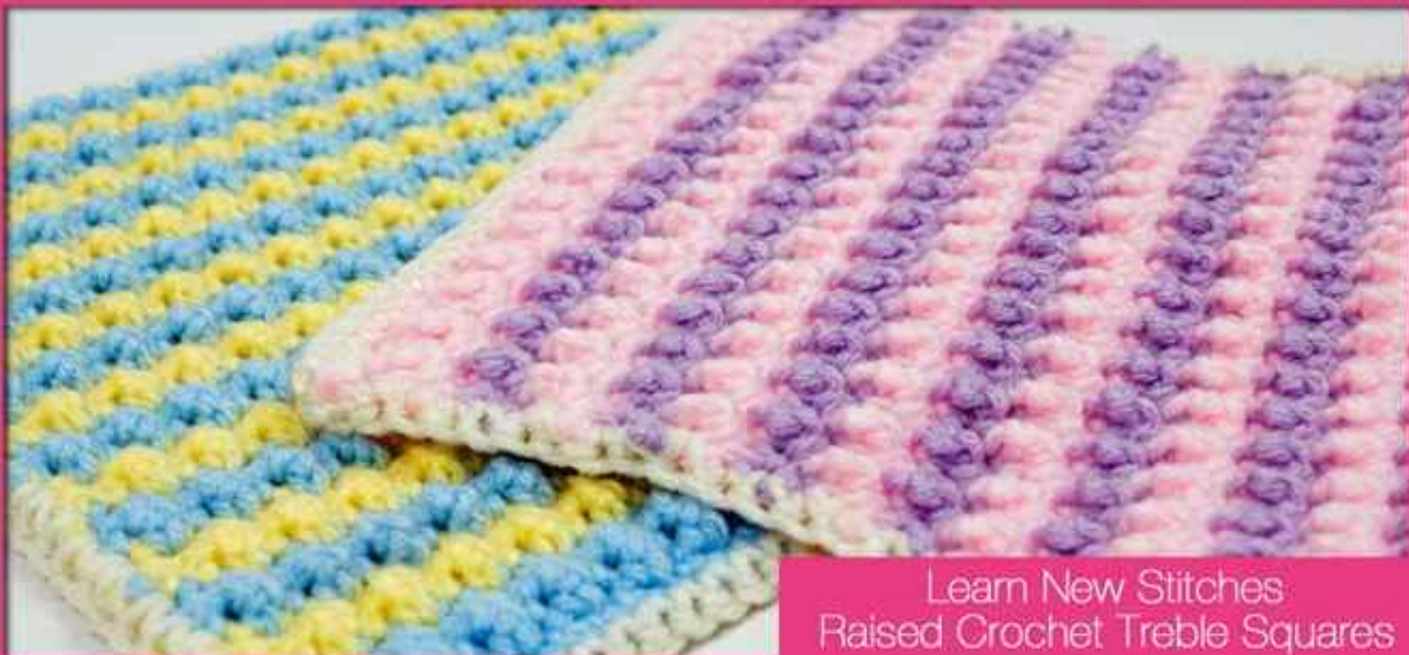
Learn New Stitches Raised Crochet Treble Squares