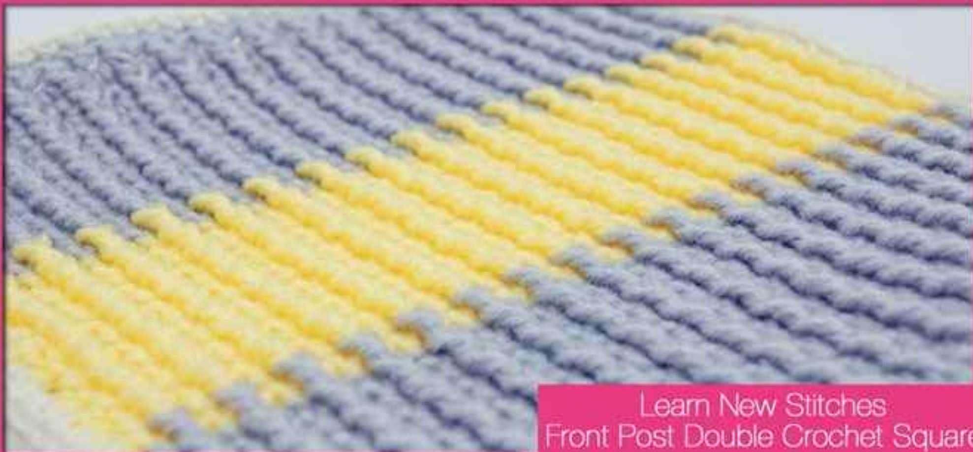
Learn New Stitches Front Post Double Crochet Square