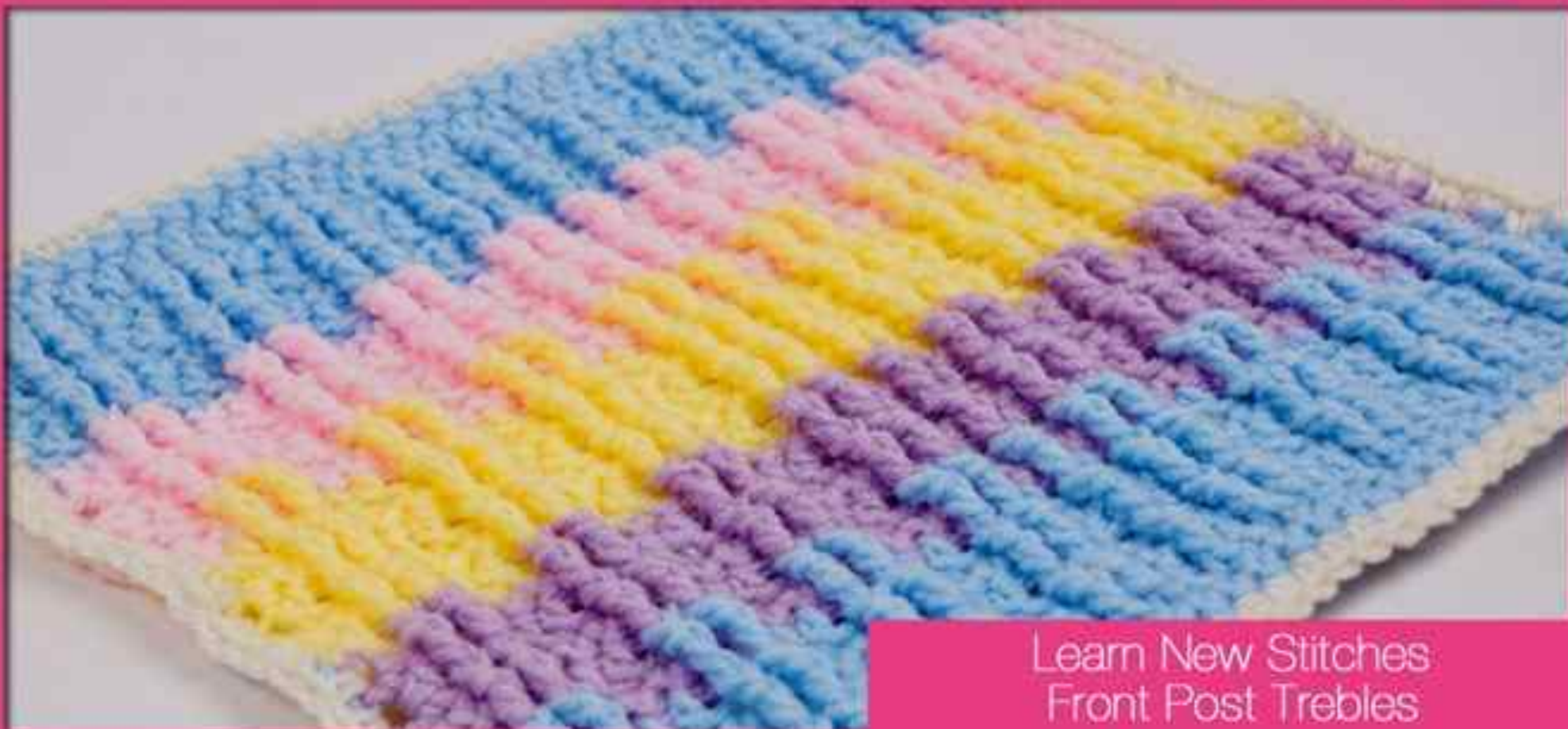
Learn New Stitches Front Post Trebles