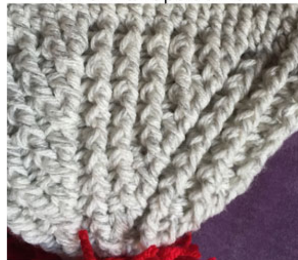
View of Hat Upside Down