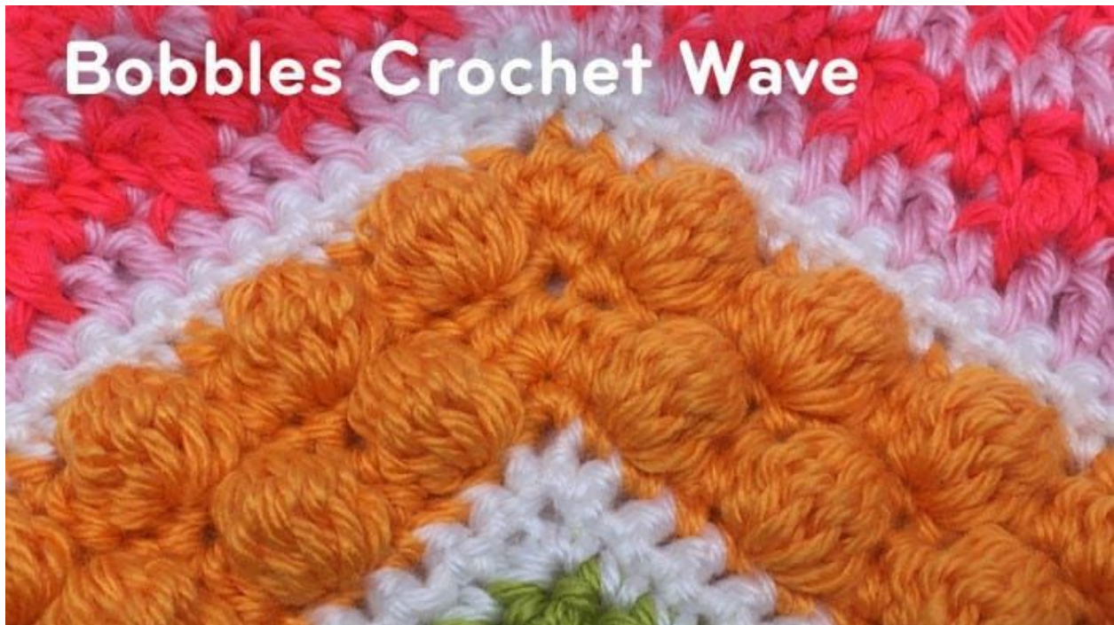
Bobbles Stitch Crochet Wave Pattern. Represented in Mango in Picture.[/caption]

[caption id="attachment_27056" align="aligncenter" width="660"]