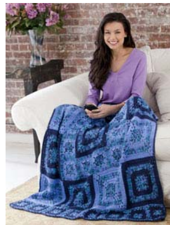
click to enlarge image

One size US H-8 (5mm) crochet hook, or size to obtain gauge.