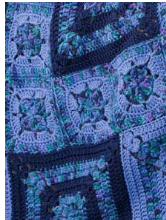
click to enlarge image