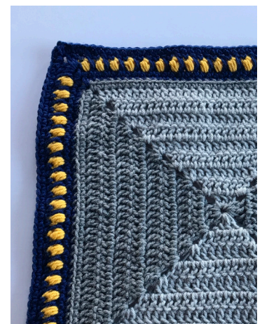
Rnd 15: Final look.

corner. Rep * 2 more times. 1 sc in last corner sp, join with hdc to beg sc. Fasten off E. - 47 sts per side