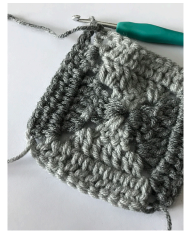
Rnd 3: Showing your goals.