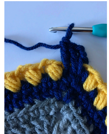
Rnd 14: Go over rnd 13 to hide chains.