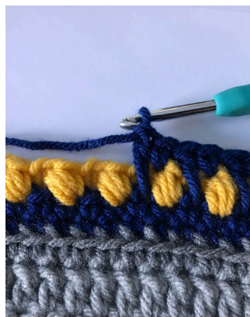
Rnd 14: Go over rnd 13 to hide chains.