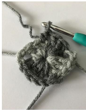
Rnd 1: Trim starting strands to prevent confusion.

Rnd 15: Ch 1. 1 sc in same corner sp. 1 sc in each st to next corner. *(1 sc. Ch 2. 1 sc.) in corner sp. 1 sc in each st to next