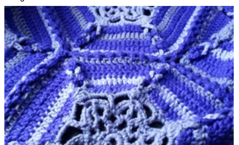
Danielle Pacrette, without spikes.

Optional Spiked Stitch Overview: Using Colour MC. The round uses random mix of half double crochet and half double crochet spikes. HDC Spikes are created by yarn over the hook and insert the hook into any of the rows directly below. Insert hook through project and yarn over. Pull yarn through and give it slack to extend the yarn back to the top of the row. Yarn over and pull through all loops on hook. Crocheters can use their own creativity in this round for how far they want to drop down for the Half Double Crochet Spikes. Being random will give this round an incredible look. You can drop down between 1 - 3 rows below. If you prefer not to have any spikes, you can just use HDC around as per the instructions. We have suggested layers for being random and they truly are random. Tip: The first 3 and last 3 stitch spaces on each side should be a regular HDC as the stitch is too close to the corner to drop straight down.