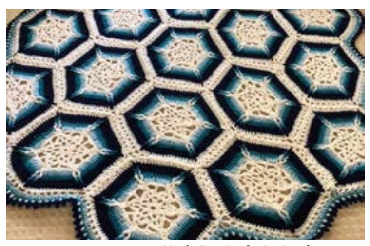
No Spikes by Catherine Cuomo