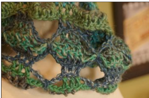
Crochet Butterfly Infinity