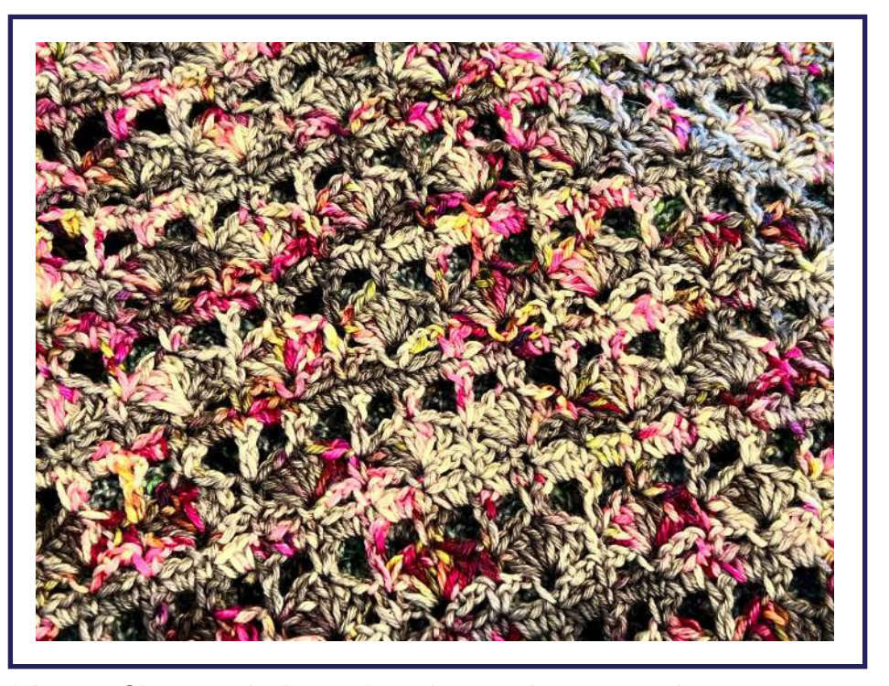
8th row: Ch 1, 1 sc in first st. *2 sc in next ch-2 sp, 1 sc in next sc, 2 sc in next ch-2 sp, 1 sc in next dc. Rep from * across. Turn.

7th row: Ch 5 (counts as 1 dc and ch 2), *sk next 2 dc, 1 sc in next dc, ch 2, sk next 2 sts, 1 dc in next sc. Rep from * across. Turn.