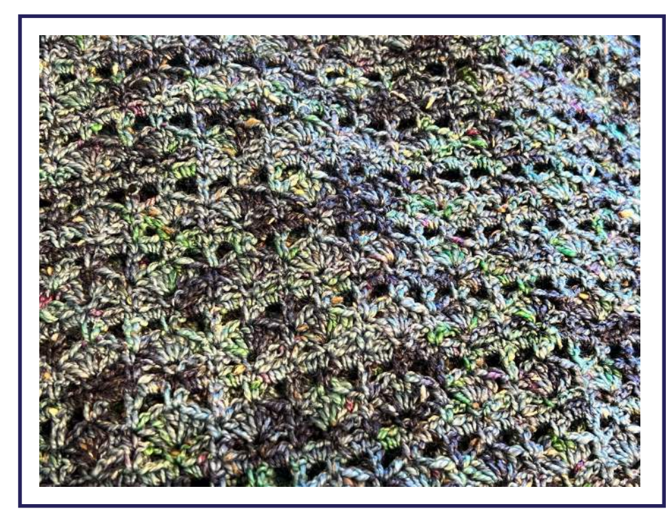
ch 2, sk next 2 sts, 1 dc in next sc. Rep from * across. Turn.

4th row: Ch 1, 1 sc in first st. *2 sc in next ch-2 sp, 1 sc in next sc, 2 sc in next ch-2 sp, 1 sc in next dc. Rep from * across. Turn.