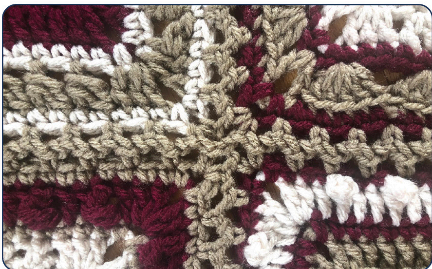
Layout Your Squares